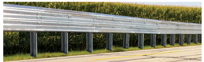
Comparison of Ezy-Guard Deflections at 2m Post Spacing