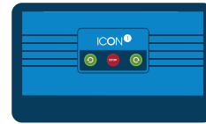
VALLEY ICON 1 ™