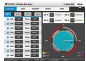
End gun programming