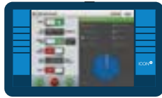
VALLEY ICON 10 ™

Valley ICONX™ easily brings any control panel – including all major pivot brand panels – into the AgSense or BaseStation3 network. It takes control of an existing panel to deliver full ICON features. It's an affordable way to upgrade and put more pivots on a single network for easier irrigation management.