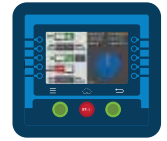
VALLEY ICON X ™