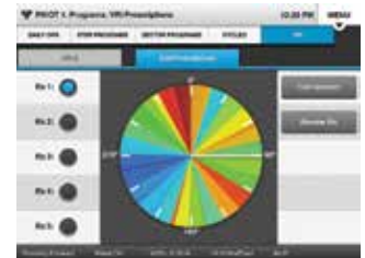
VRI Speed Control programming