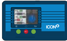
VALLEY ICON 5 ™