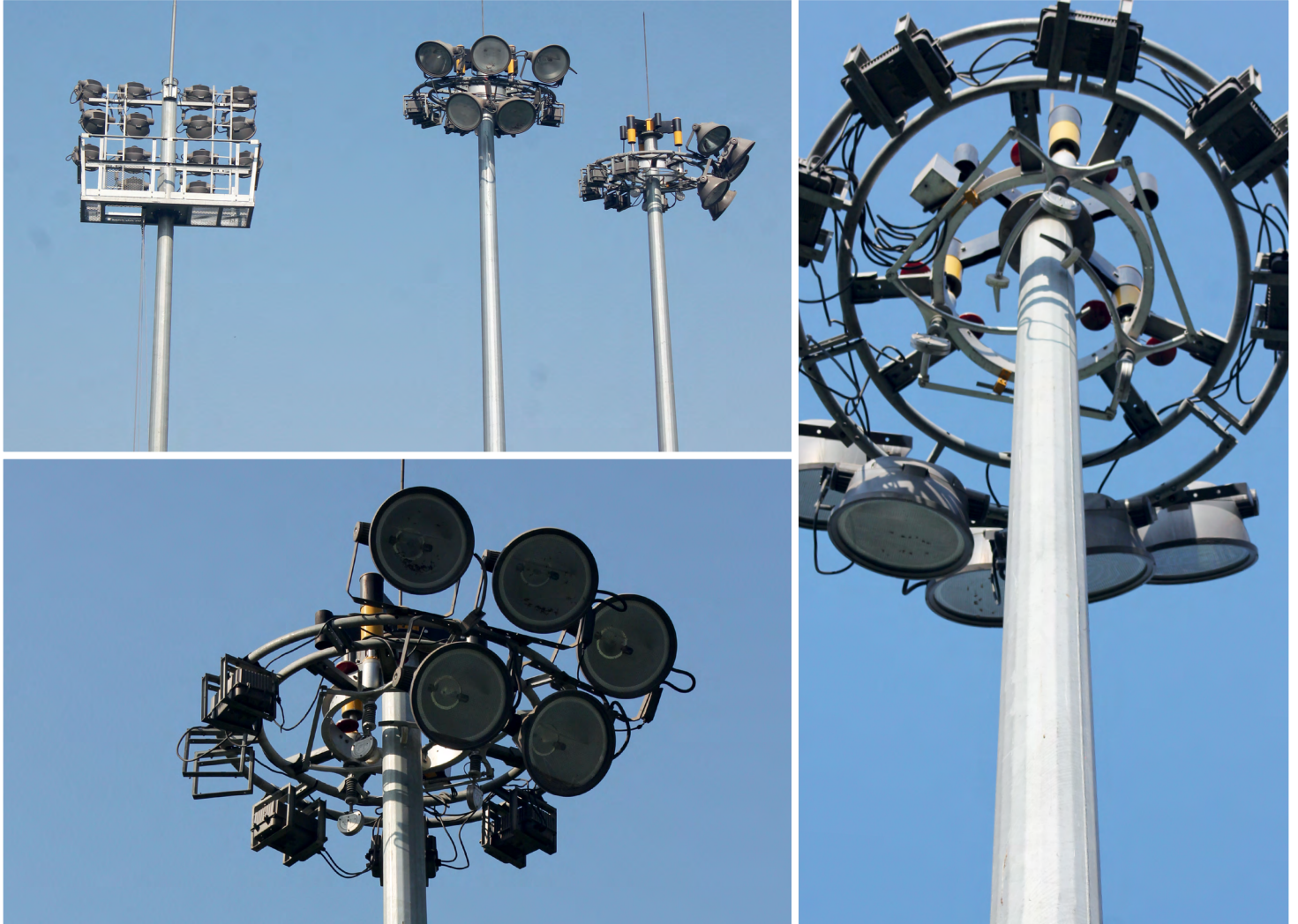
R.K. KHANNA TENNIS COMPLEX, NEW DELHI

High activity areas - merging expressways, airports, heavy-industry zones - require an extra emphasis on safety and security. That's why we created our high mast lighting poles.