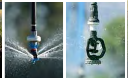
R3000 – LOW PRESSURE SPRINKLER HEAD NELSON IRRIGATION