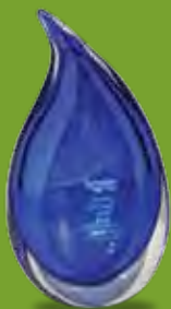
LINEAR AUTOPILOT CONTROL PANEL 2008 TOP AG PRODUCT IRRIGATION ASSOCIATION